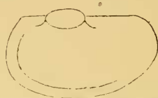
Fig. 2. Æchmina cuspidata .

Carapace-valve suboblong, convex and produced at the middle (towards the postero-dorsal region) into a stout sharp spike; dorsal edge straight, ventral edge elliptical; one end more broadly rounded than the other.